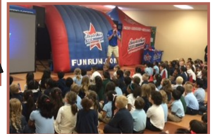
Boosterthon Pep Rally

Don't forget the Boosterthon Fun Run will take place on Thursday, March 12th.