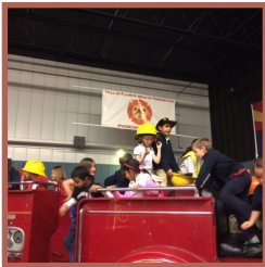
1st grade field trip to the Hall of Flames Museum of Firefighting